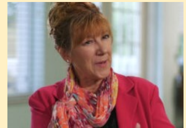
View Video Tour