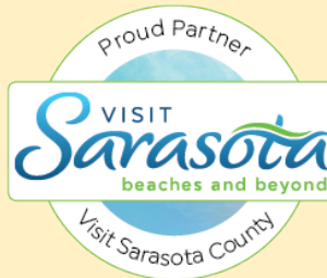
Partner in Visit Sarasota Tourism