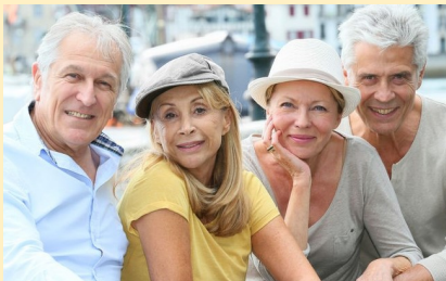
Health & Wellness Tourism

A Unique Alternative for Active Seniors Considering Condo, Hotel, Private Home, or 55+ Community Living