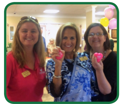
The ice cream social was a tasty success!